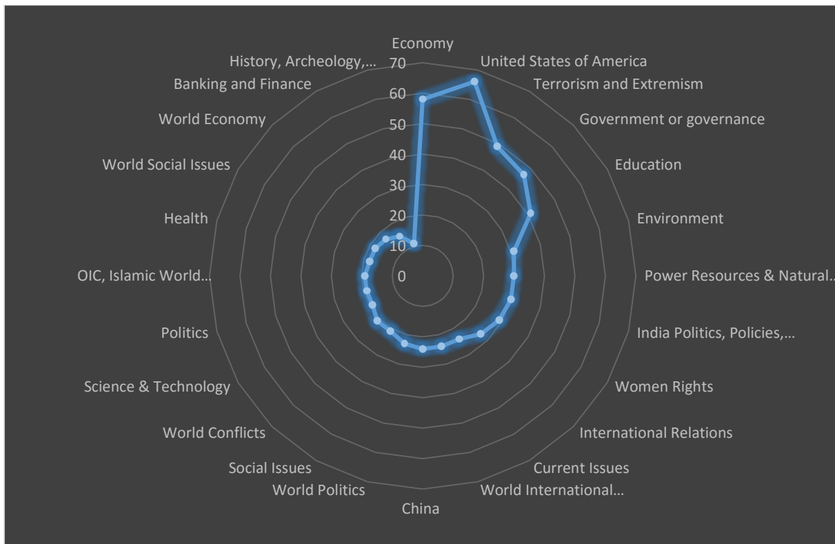
Figure 3: Major publishing trends in Pakistani newspapers (with minimum frequency of 15)

The combined trends (with minimum frequency of occurrence = 15) from the indexed topics in Pakistani and international contexts reveal significant patterns of media focus and public discourse, highlighting areas of national and global interest. It highlights a notable disparity in focus, with a strong emphasis on domestic issues compared to global ones.